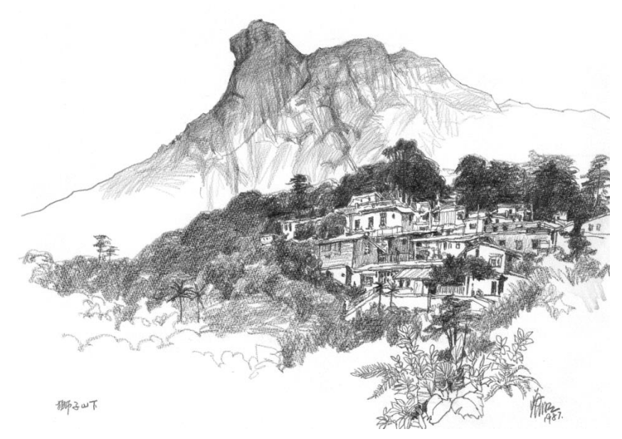
Kong Kai Ming, Lion Rock, Pencil on paper, 1987, 37 x 45 cm

HONG KONG, 12 Sep 2018 Tiancheng International is pleased to present "A Trail of Memories —