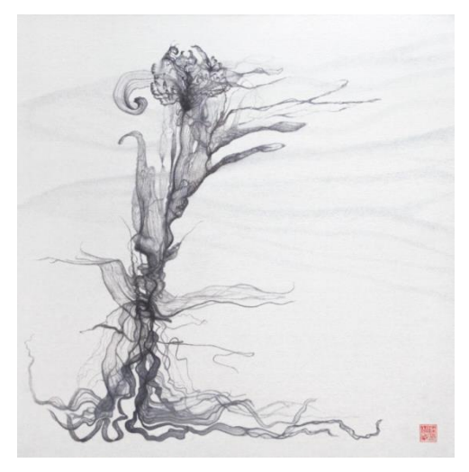
Super/Natural – Dancing No.1 Oil-based felt-tip pen on canvas 2015

the artist explores the beauty and serenity of nature from a bird's eye view. The artworks allow the viewer to see nature from a different perspective, where one can imagine oneself floating freely in the air. The series highlights the charms of nature and explores our existence and relationship with the environment.