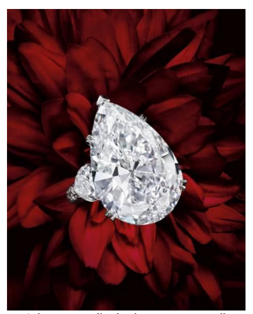
Lot 237 / 29.53-Carat D Colour Internally Flawless Type IIa Excellent Polish Diamond Ring Estimate: HK$ 22,000,000 - 32,000,000 / US$ 2,820,000 - 4,100,000

Preview: 28 Nov – 1 Dec | Auction: 2 Dec