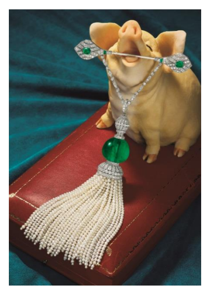
Lot 63 Natural Colombian Emerald, Seed Pearl and Diamond Pendent Brooch, early 20<sup>th</sup> century

Estimate: HK$1,800,000-2,500,000 / US$230,000-320,000